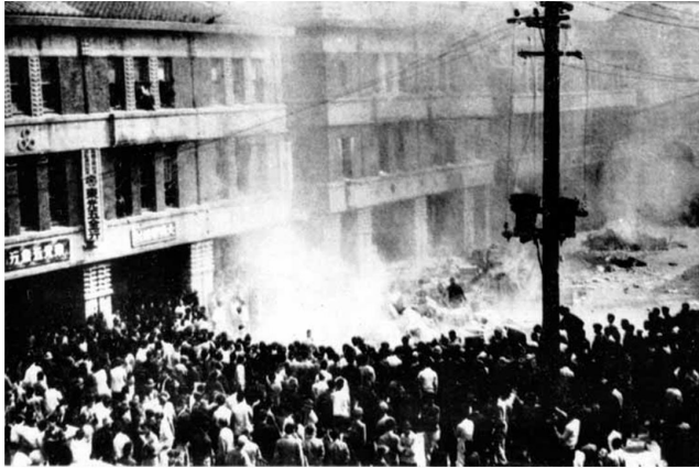
Crowd gathers in front of the Tobacco Monopoly Bureau on Feb. 28, 1947

The White Terror is perhaps the darkest period of history in Taiwan. Starting with the 228 Massacre in 1947 until the end of the martial law on July 15, 1987, the White Terror had wiped out an entire generation, culturally and historically. The Republic of China (ROC), under the aim of taking back all of China, targeted individuals in Taiwan that spoke up against the government or had a strong sense of Taiwanese identity.