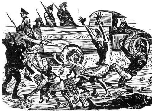
2-28 Incident in woodcut; the artist was executed